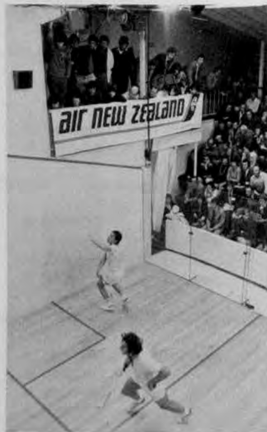
Action from the N.Z. Championship final at North Shore.

Publicity received was excellent throughout from Press and Radio, and culminated in the televising of the two finals by TV 2.