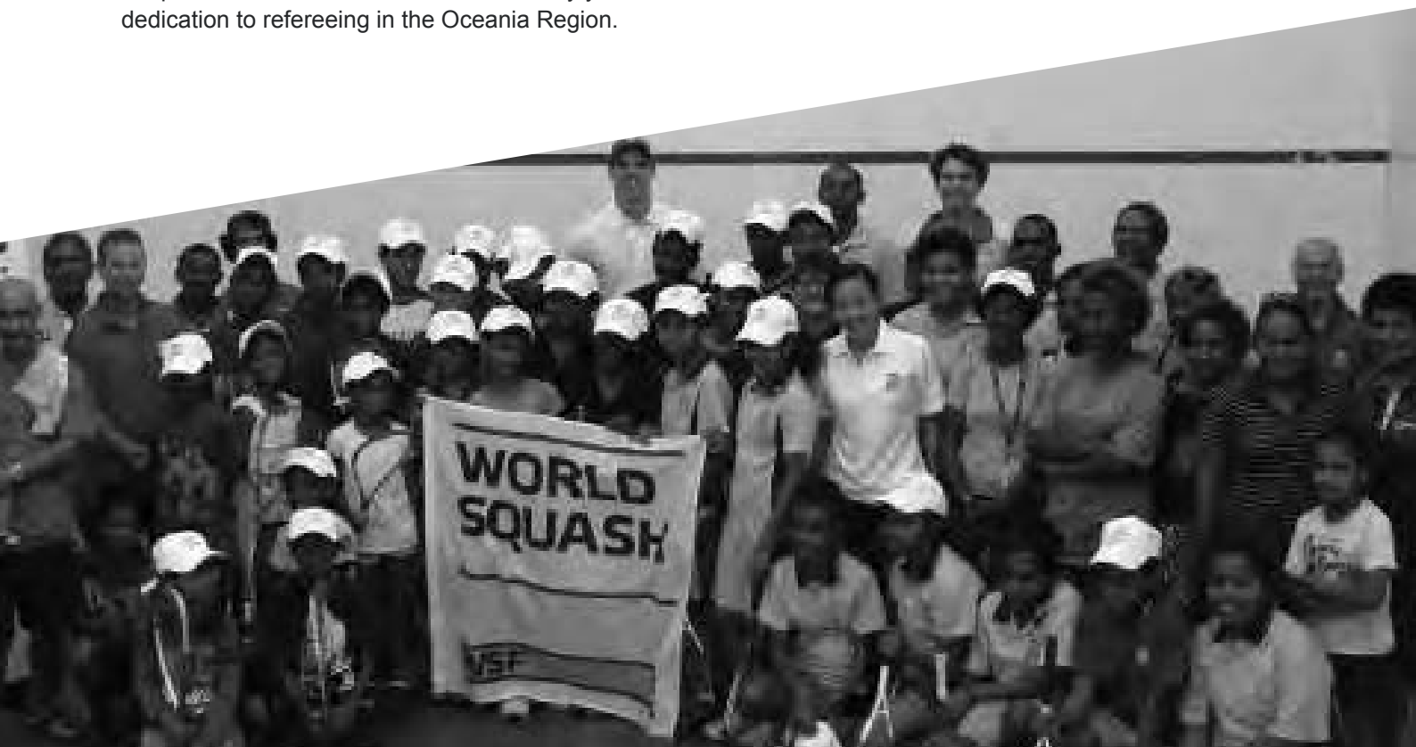
The Fourth WSF Ambassadors Programme team pictured with participants and members of PNG Squash