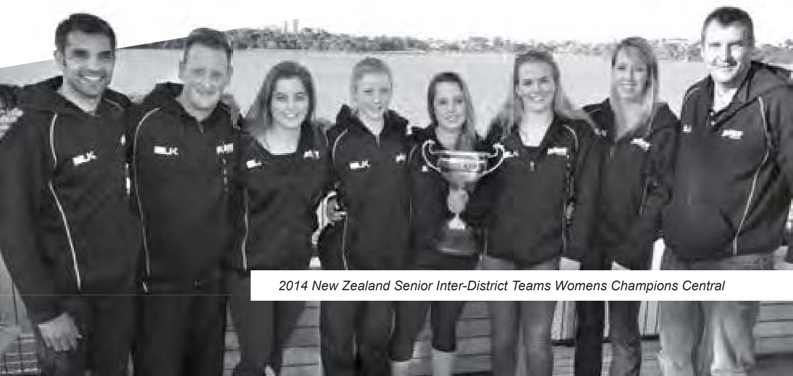
2014 New Zealand Senior Inter-District Teams Womens Champions Central

New Zealand Finished 18th (Seeded 18-20th)