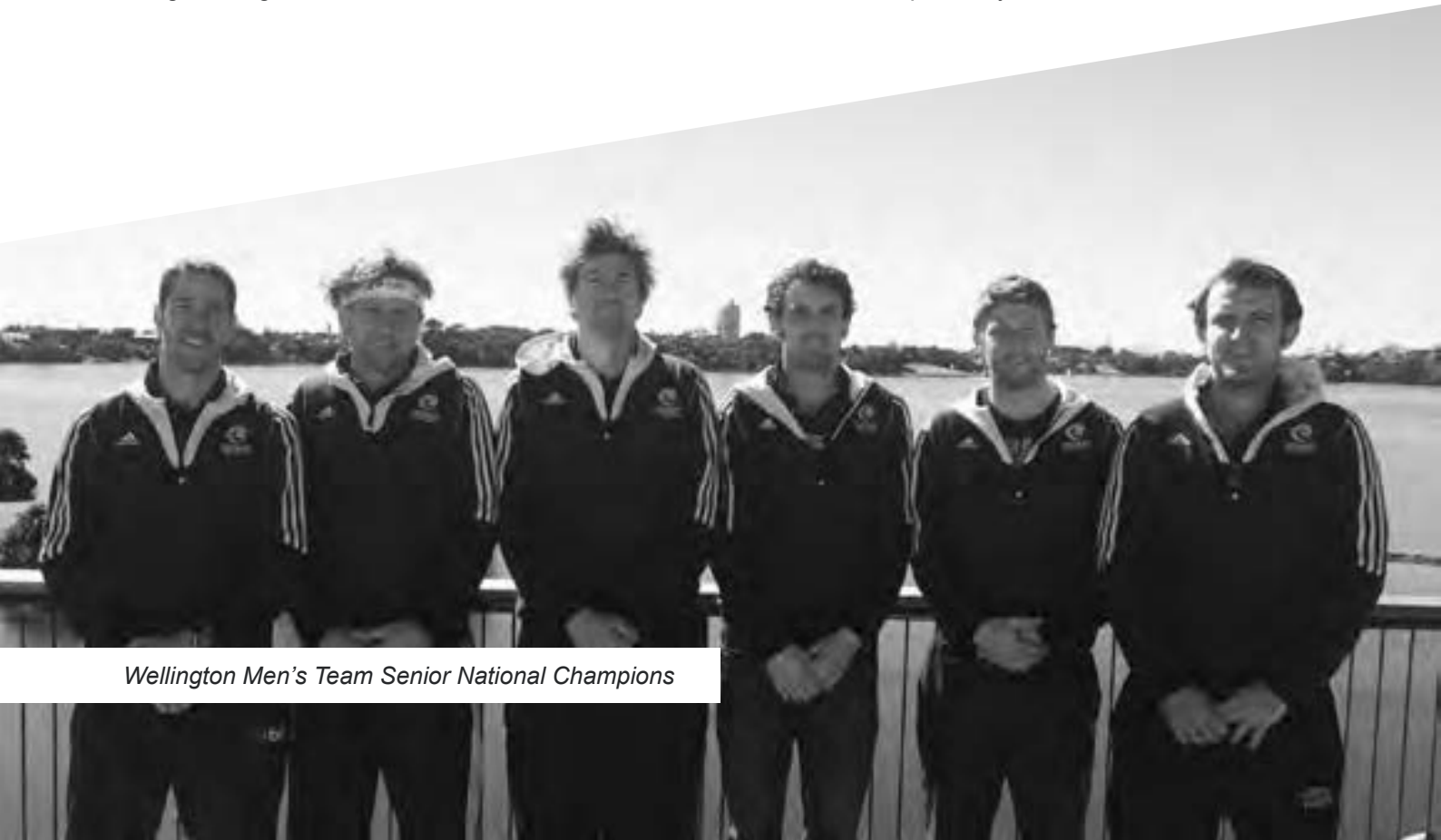
Wellington Men's Team Senior National Champions