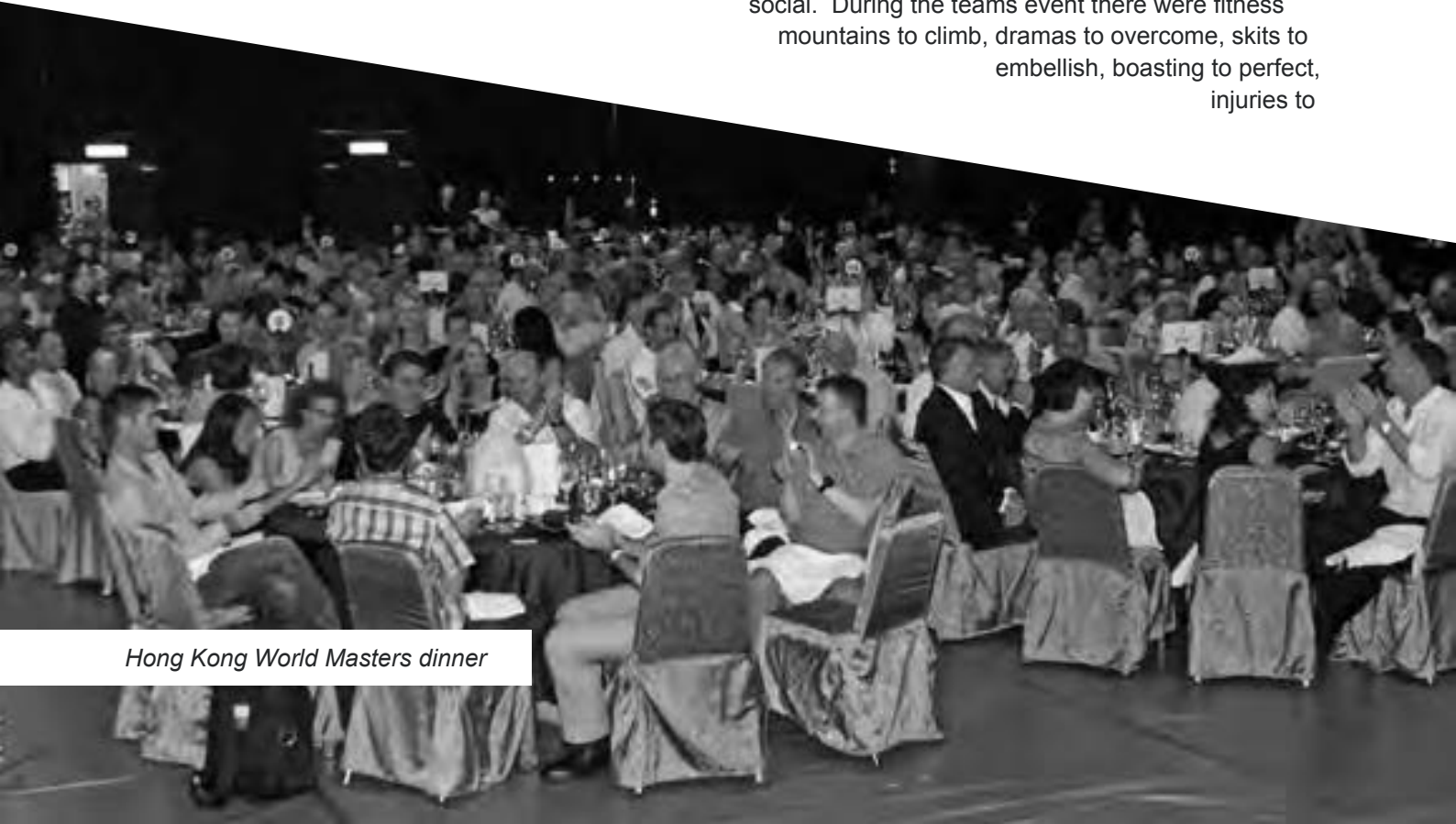
Hong Kong World Masters dinner