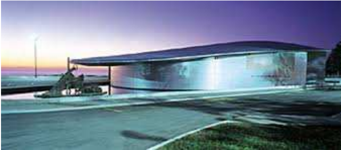
National Aquarium of New Zealand