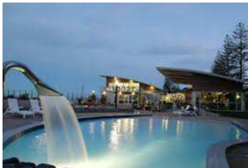
Ocean Spa best place to relax the muscles