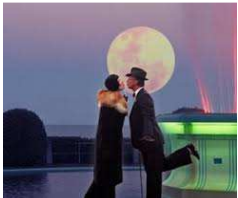
Night at Tom Parker Fountain